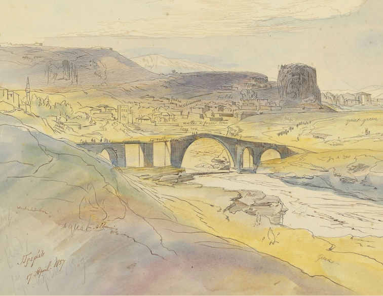
View of Përmet by Edward Lear, 1857.