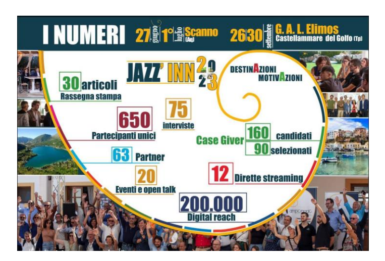
Figure 1-Jazz'INN Festival total audience online and offline